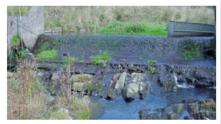
Above, Scottish Water Weir 2003; below, new fish pass 2013